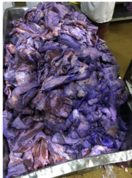
After electrostatic intervention

Elite 360 ® electrostatically applies an antimicrobial intervention to cover the product, using the least amount of antimicrobial possible, while still being as effective as possible. Transfer efficiency, the ratio of antimicrobial applied to the meat surface compared to the amount sprayed, was found to approach 90-100 percent in Birko’s testing.