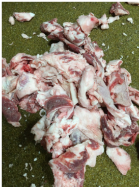
Before electrostatic intervention